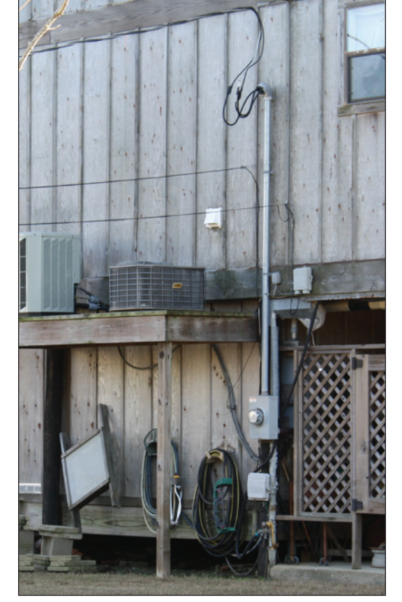
Figure 1. Electrical components installed below the lowest floor system are subject to increased flood damages and lengthy outage durations (St. Tammany Parish, LA)