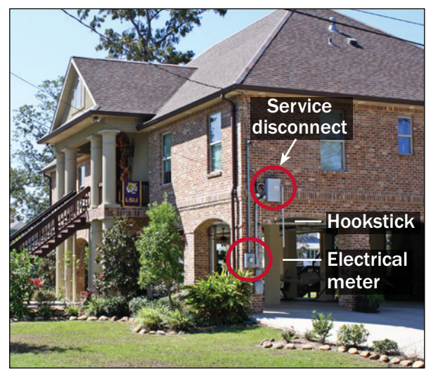
Figure 4. Other than the electrical meter, all the electrical components are elevated and protected from flooding at this home. The system incorporates an electrical service disconnect that is remotely operable with a hookstick (St. Tammany Parish, LA).

• In addition to adhering to the elevation requirements in areas with high-velocity floodwaters, any utilities located below the design flood elevation should be placed on the landward side of the building and attached to foundation elements, such as piles or columns.